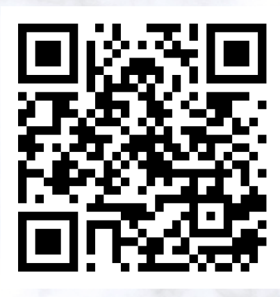
Scan QR Code to register